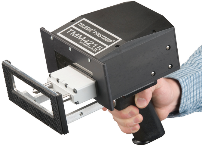
Shown with optional debris shield

The innovative PINSTAMP® dual-pin TMM4215 provides a 4" x 0.5" (100mm x 13mm) marking window, twice as large as that of the TMM4200. This lightweight, compact marker is available in both fixtured and hand-held configurations.